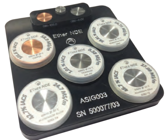
Conductivity Test Blocks In Holder

ETher NDE also manufacture individual conductivity test blocks which may be used to match the clients own testing requirements. We can also provide a handy test block holder (Part number: ASIG003) that can hold up to five of these test blocks at any one time as shown above.